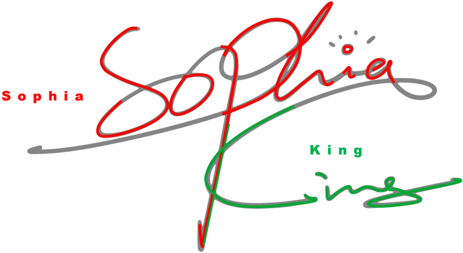
S o p h i a K i n g

Description of the distribution of letters in signatures: